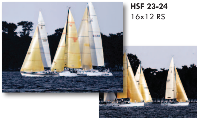
HSF 23-24 16x12 RS