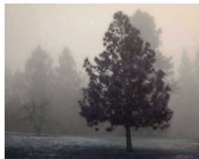
VIT 10-11 14x11 RQ