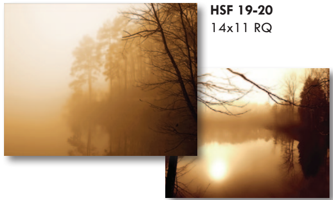
HSF 19-20 14x11 RQ