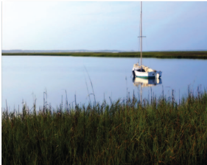
HSF 21-22 14x11 RQ