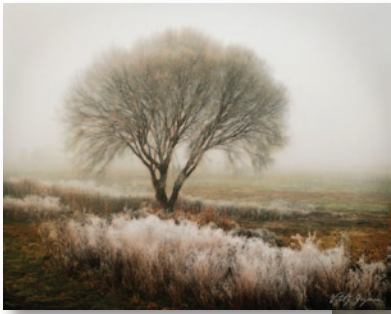
VIT 12-13 14x11 RQ