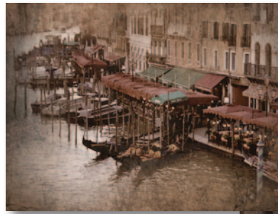
WRN 10-11 16x12 RS