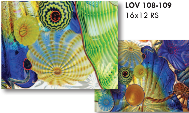
LOV 108-109 16x12 RS