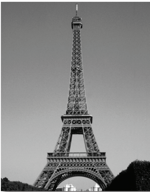
FST 10-11 11x14 RQ