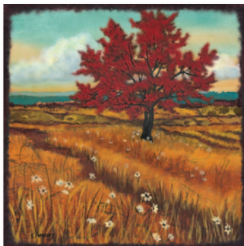
ANG 10-11 18x18 RY